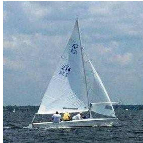
Here is a profile shot of the new Flying Scot boat "Spirit of Navy"