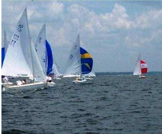
The Navy Yacht Club's new flying scot in action (pictured with the Navy Blue & Gold Spinnaker sail in the center) at the Ft. Walton Yacht Club's Meigs Regatta held on July 11 th and 12 th. Go Navy!