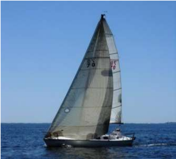
Piranha at the Commodore's Cup Race #3