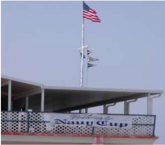
The Flags flew high above the Crow's Nest at Bayou Grande Marina during the 48 th Annual Navy Cup Regatta.