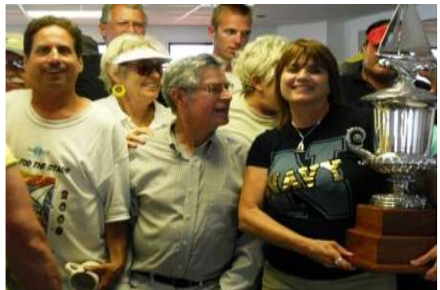
Overall Winners – Navy Yacht Club