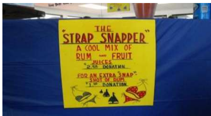
Specialty Drink for the 2011 Bikini Regatta