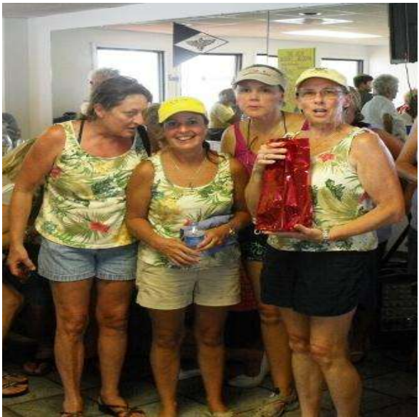
The Crew from Memories enjoyed receiving their trophy for the Best All Female Team in the Cruiser Class.